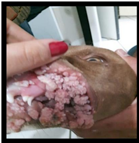
Figure I. Aspect of lesions in the patient's oral cavity.

The animal presented clinical symptoms of papillomatosis with warts in the oral cavity ( Figure I ); no hematological alterations were found in the first blood count. The first blood count was performed at the beginning of treatment on May 5 th , 2016 ( Table 1 ). No other tests were performed to evaluate the other parameters. At 14 days of treatment initiation, a significant clinical improvement of the lesions was observed ( Figures IIA and IIB ). A new blood count was performed on June 25 th , 2016 ( Table 1 ), after 30 days of treatment initiation, to monitor the patient's health status, showing clinical improvement of the lesions initially presented and complete resolution of the case ( Figures IIC and IID ).