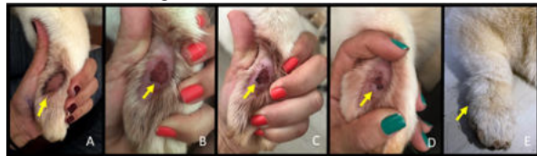
Figure 2. The yellow arrows indicate A) Initial skin lesion (acral dermatitis); B) Lesion aspect four days after treatment initiation. Granulation tissue is also noted around the lesion; C) Lesion aspect seven days after treatment initiation; D) Lesion aspect four days after treatment initiation; E) Lesion aspect 70 days after treatment initiation.

The patient showed progressive improvement after treatment initiation (Figure 2A), decreasing the licking behavior. Granulation tissue was formed at the edges of the wound (Figure 2B) four days after treatment initiation. Subsequently, according to the photographic records (Figures 2C and D), the improvement occurred quickly and efficiently. The total lesion resolution occurred in 15 days and complete growth of fur in the site was accomplished in 70 days (Figure 2E). The patient's real owner returned from travel 17 days after the onset of clinical signs.